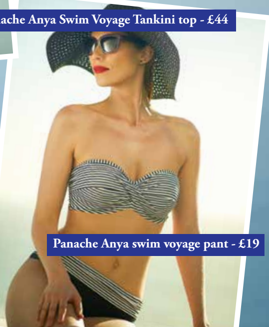
Panache Anya swim voyage pant - £19