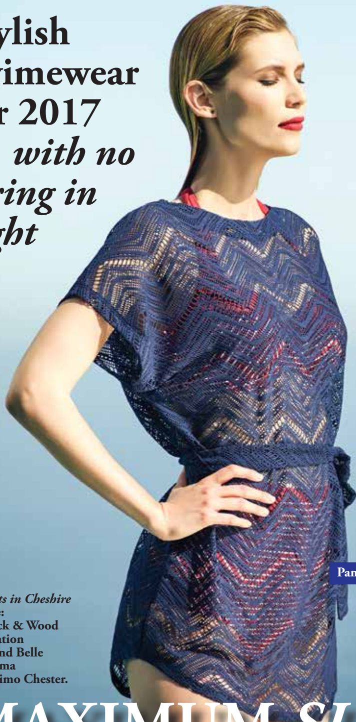
Panache sun dress - £35

Stockists in Cheshire include: Hancock & Wood Foundation Betty and Belle Bellissima Bravissimo Chester.