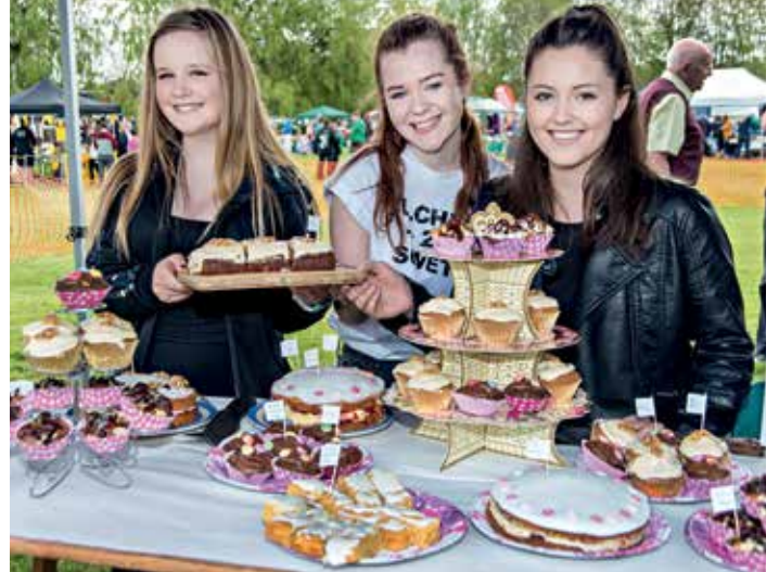
Cake stall at the 2015 event.