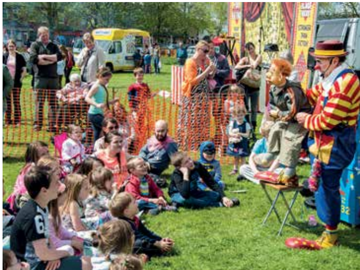
Trumble the Clown will be absent after retiring.