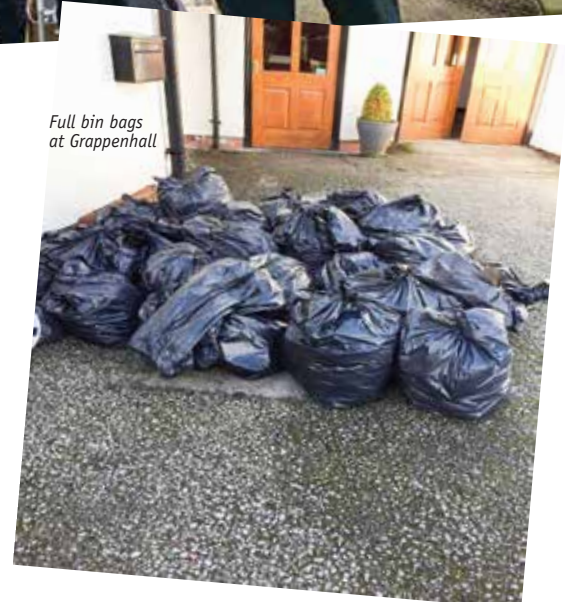
Full bin bags at Grappenhall