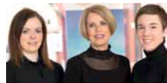
Stockton Heath @ Hays

The Bay of Gibraltar is famous the world over for its ever present population of wild dolphins and 'Billy' Bottlenose is a permanent resident in the Bay of Gibraltar. Regular whale watching trips are also available. Something that you may not know is that Gibraltar has over 40 dive sites, including wrecks and reefs, which are all teaming with marine life, aimed at the experienced diver but also for the first-time novice. For those who enjoy contact with nature, the Gibraltar Nature Reserve (converted in 1993), occupies the upper part of the Rock and provides a habitat for plants and animals, which are found nowhere else in mainland Europe.