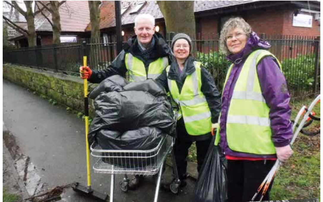
The team busy near Stockton Heath Medical Centre.

At Knutsford, the Friends of the Heath and the Friends of the Moor both carried out litter picks on their respective patches.