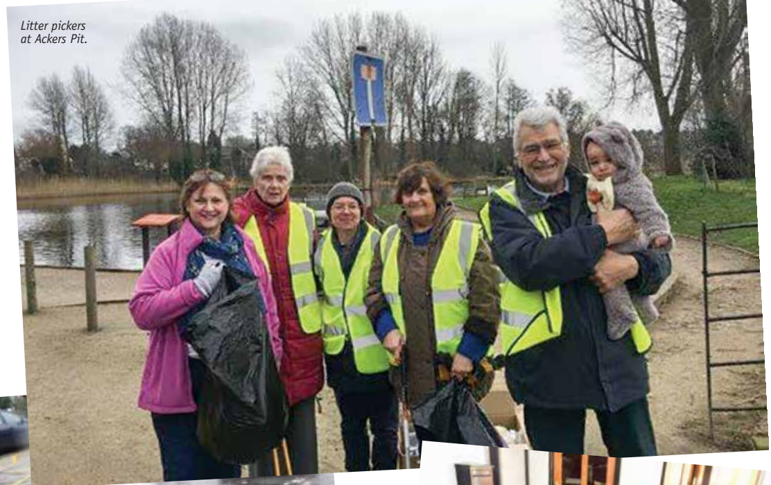
Litter pickers at Ackers Pit.