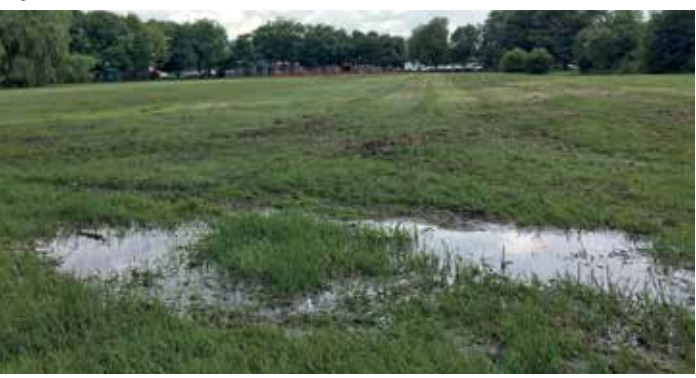
Last year's flooding of the Village Green.