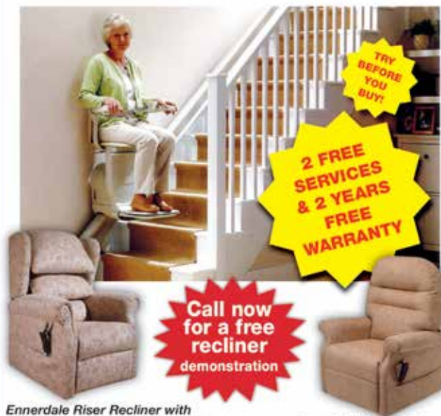
Ennerdale Riser Recliner with Waterfall Cushions in Spray Jute