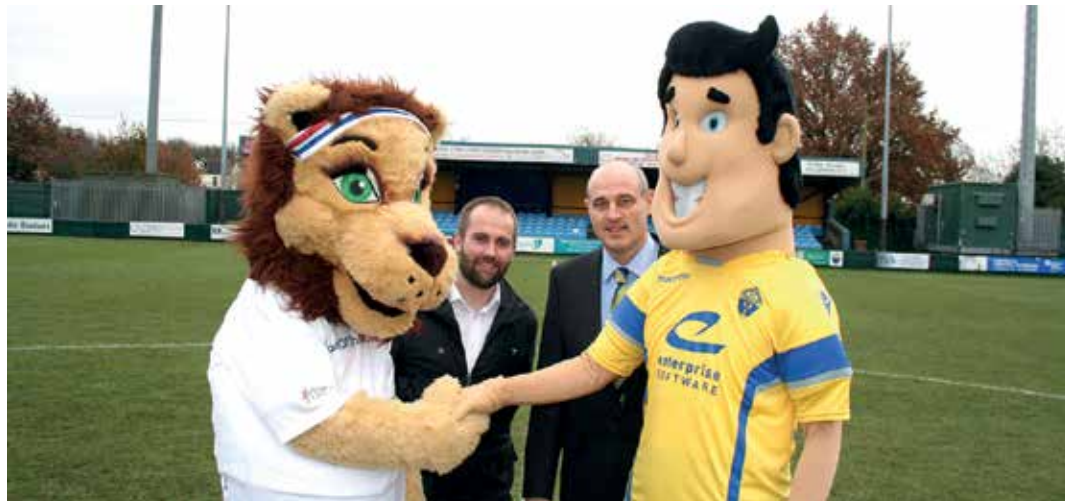
Active Cheshire getting Active in Warrington as Warrington Town's new community sponsor.