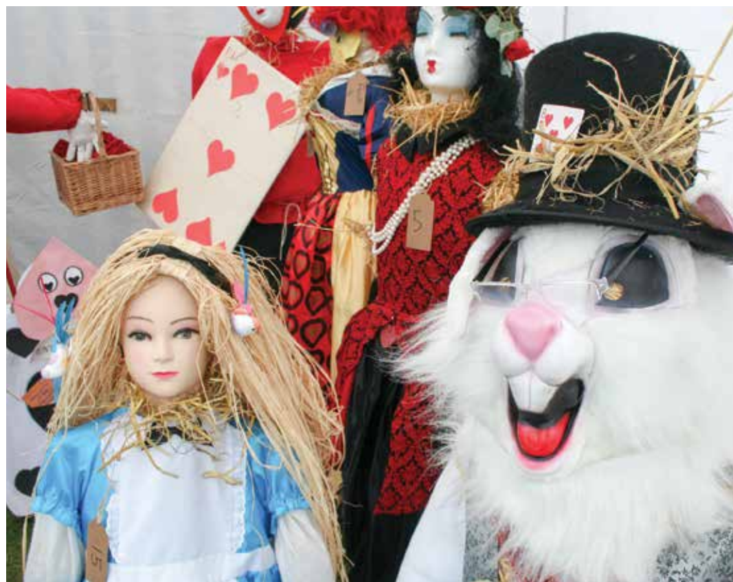
Scarecrow characters at last year's festival.

PLANNING is well under way for next year's Stockton Heath Festival which will be held from Thursday June 29 to Sunday, July 2 2017.