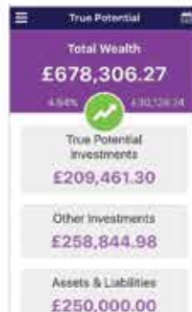
See all investments on one screen