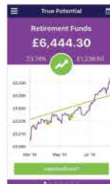
Monitor and edit your goal