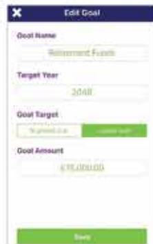
Set a goal for your investment

Financial Conduct Authority (FCA). Authorisation Number 511977