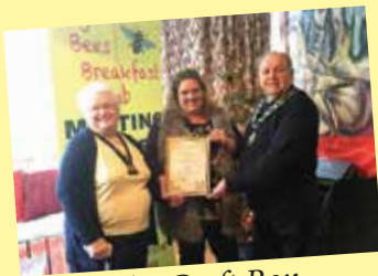
The Craft Box