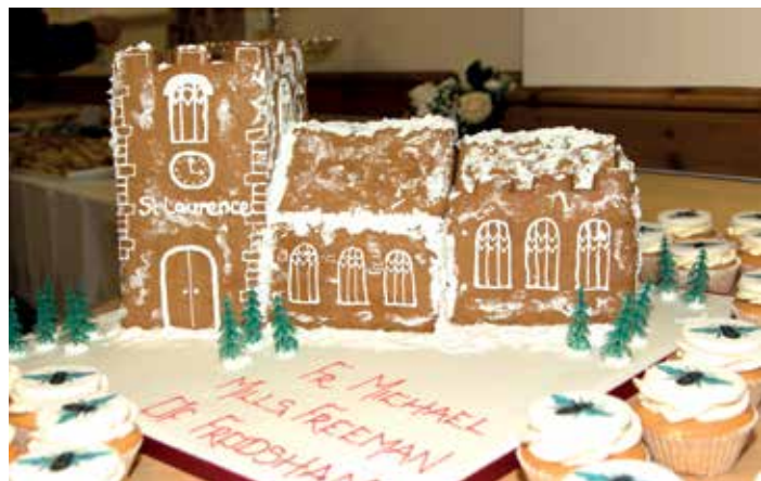
A special cake created by Devonshire Bakery.