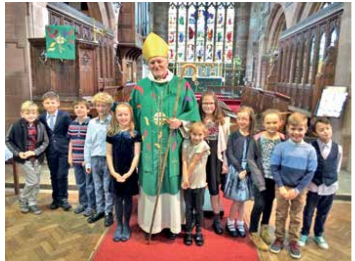
Year 4 pupils with the Bishop of Birkenhead.