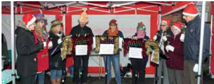
Newchurch handbell ringers

More pictures online at www.warrington-worldwide.co.uk