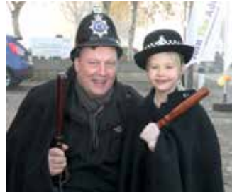
Youngsters enjoyed the police museum

Keeping people entertained throughout the day were children's roundabouts and crafts, music, a ukulele band, Bell ringing, carol singing and a display of police memorabilia and uniforms to try on. For the peckish and to help keep the cold out there were purveyors of traditional festive fayre such as