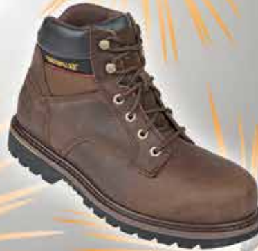
CATERPILLAR BROWN SAFETY BOOTS