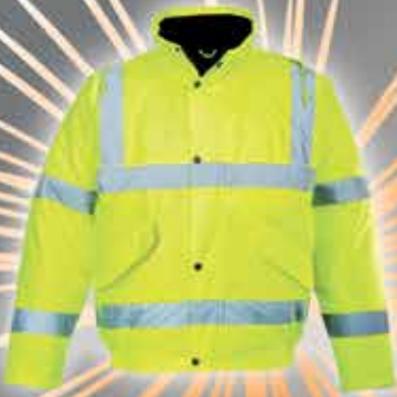
PORTWEST HI-VIZ BOMBER JACKET