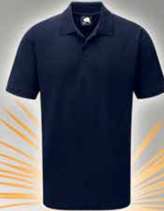
ORN EAGLE POLOSHIRT