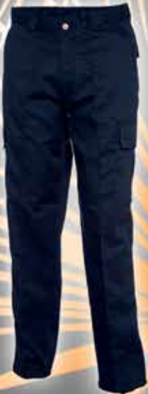
UNEEK CARGO TROUSER