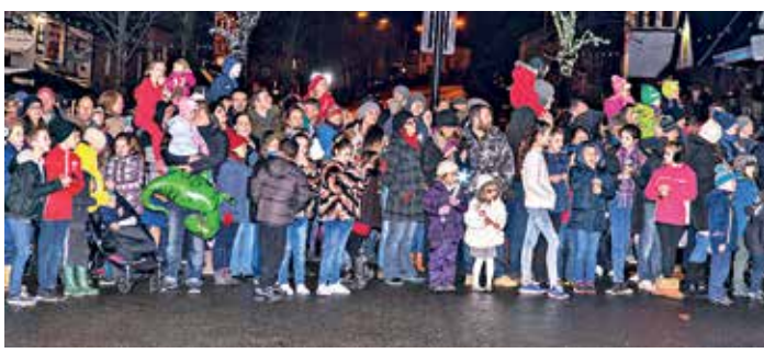
Crowds flock to last year's festival.