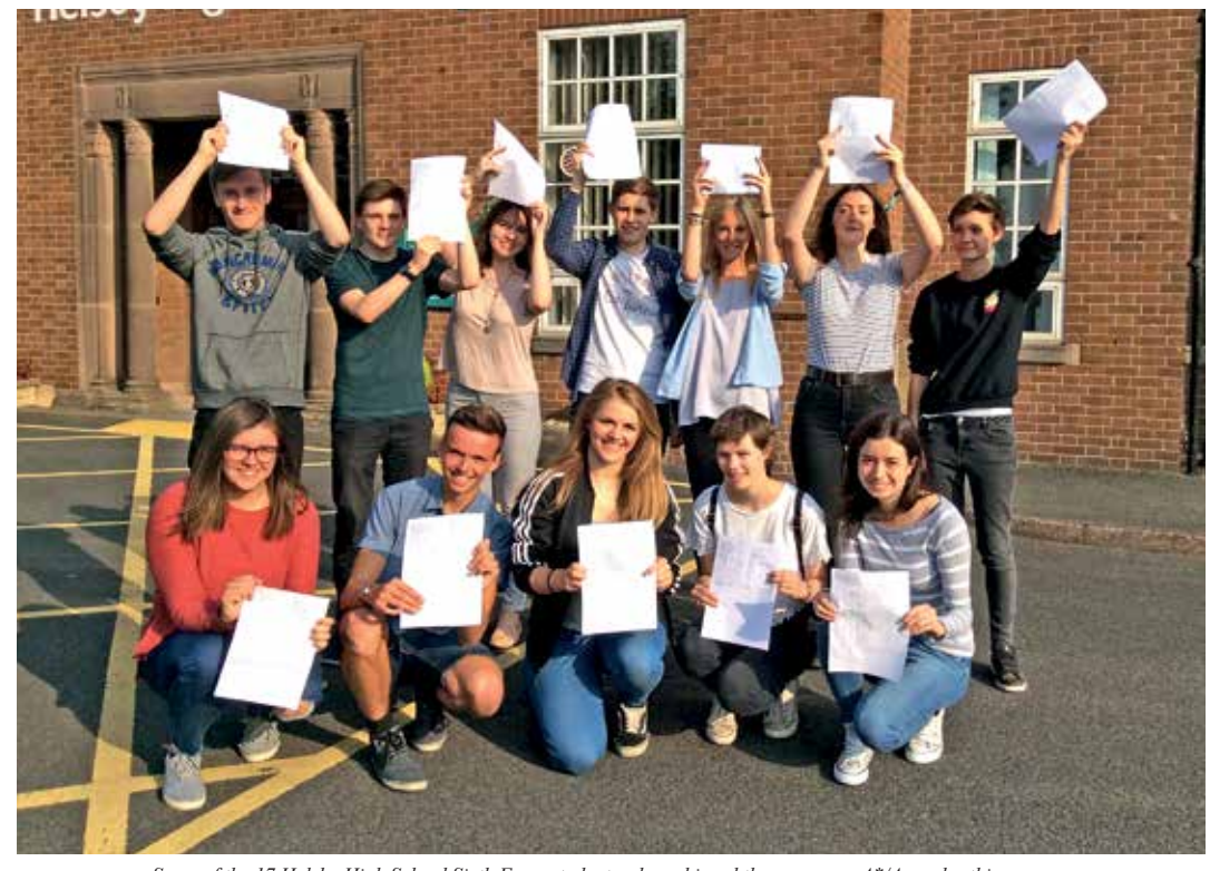
Some of the 17 Helsby High School Sixth Form students who achieved three or more A*/A grades this summer

contributed so much to the school during their time with us and I am sure that they will use their wide range of skills and academic qualifications to achieve further success in the future."