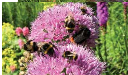
Busy bees at Dingle Farm.