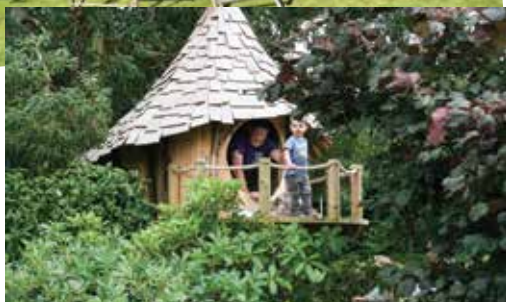
Tree house fun at Laskey Farm.