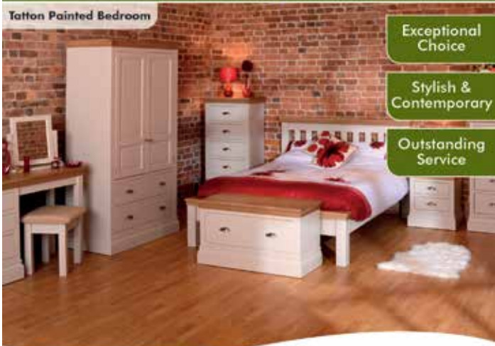
Tatton Painted Bedroom