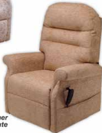
Langdale Riser Recliner in Herringbone Jute

Recliners Start from £599 with FREE Home Demo includes 3 year warranty