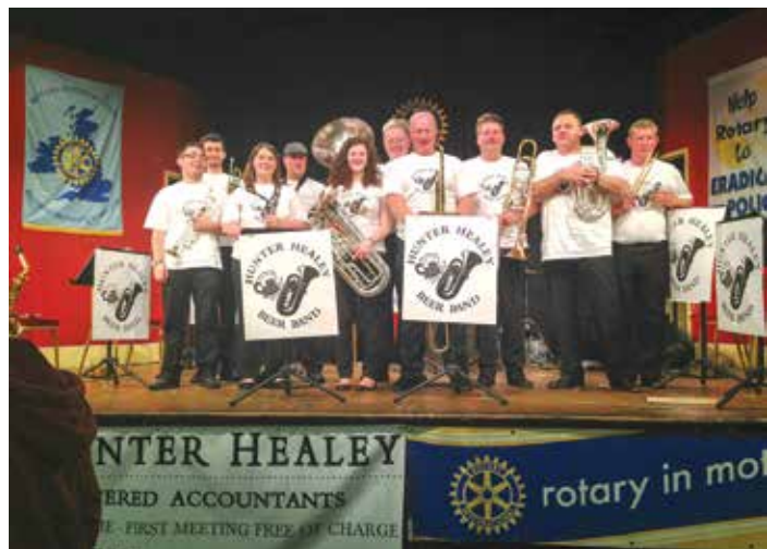
The Hunter Healey Band at last year’s event.