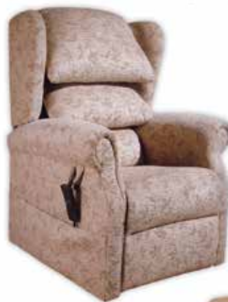
Ennerdale Riser Recliner with Waterfall Cushions in Spray Jute