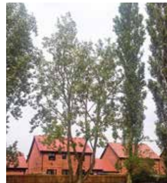
Trees at Fowley Common after surgery.

The council says even when consent is given for work on a protected tree, such consent does not override the legal rights of landowners. If any works take place on private land, the third party would need to get the landowner's permission and anyone seeking consent from the council is made aware of this.