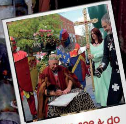
Lots to see & do