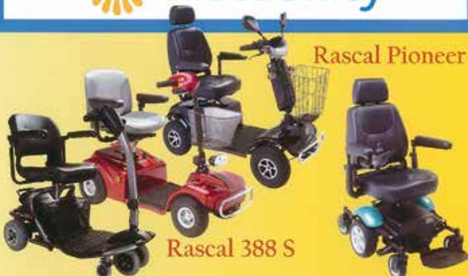
Liteway Balance Plus