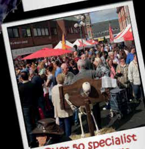
Over 50 specialist medieval stalls