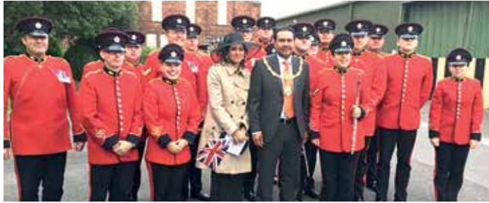
A special Proms in the Park took place at Peninsula Barracks in Warrington celebrating the 300th anniversary of the Corps of Royal Engineers.

The event was organised by the 75 Engineer Regiment and included performances by the Band of the Corps of Royal Engineers, Warrington Male Voice Choir and Warrington Pipe Band.