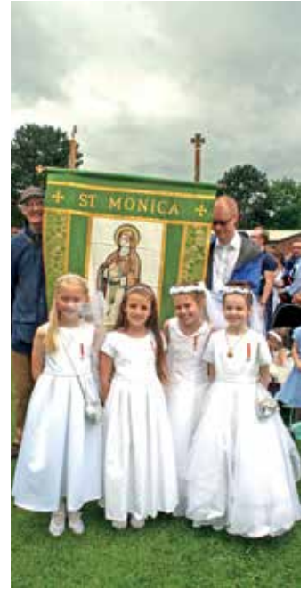
■ St Monica's Church