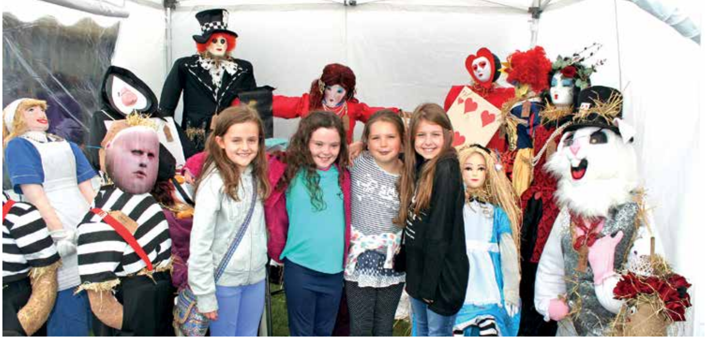
Local youngsters with the scarecrows on the festival field.