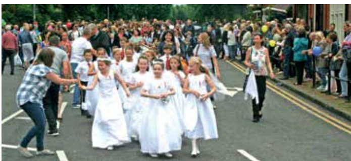
■ The tradition of handing money to youngsters taking part in the walk.