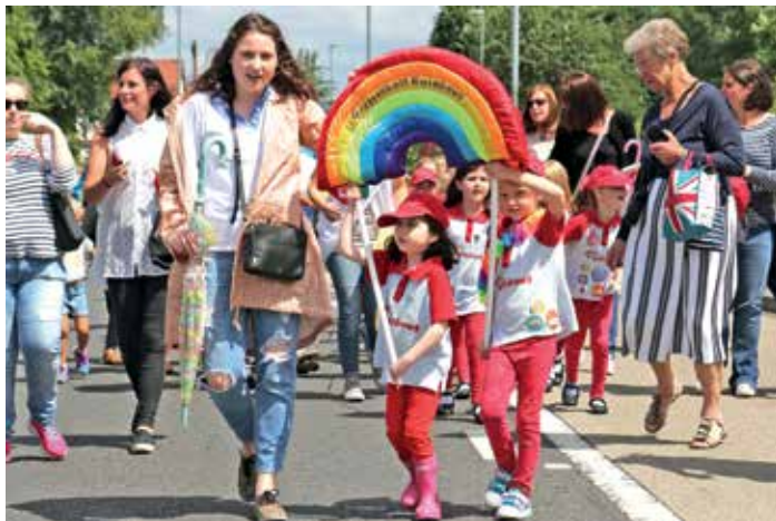
■ Rainbows enjoying the walk.