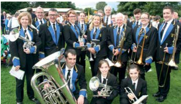
■ Cadishead Public Band.