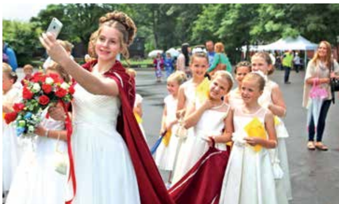
■ Selfie time for the new Grappenhall Rose Queen.