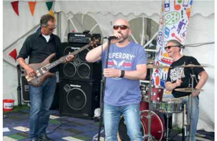
A local band entertains the crowds.

More pictures online at www.warrington-worldwide.co.uk