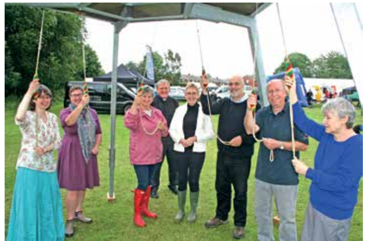
St Thomas' bell ringers who are looking for more recruits.