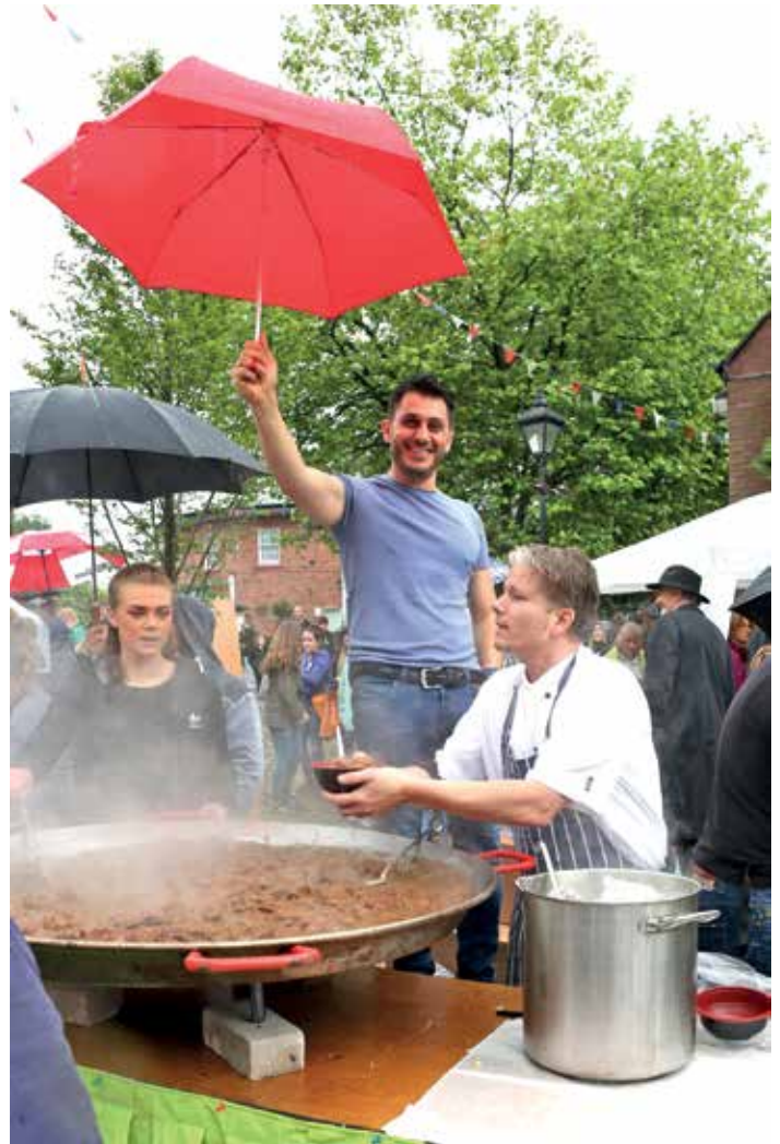
Recipe for success.

More pictures can be viewed on line at www.warrington-worldwide.co.uk