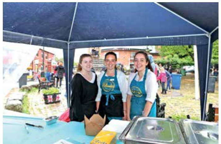
The team from Rolandos.