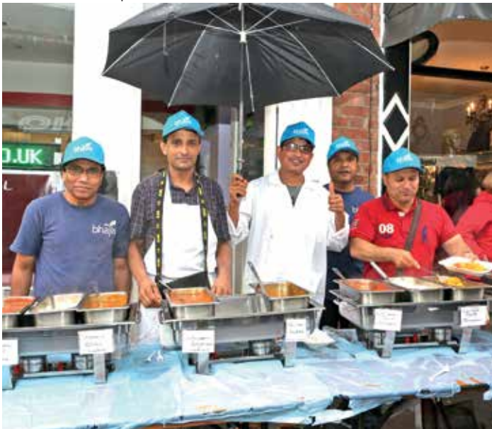
Brolly good show from the team at Bajis.