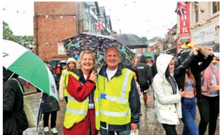
Festival crew putting on a brave face.