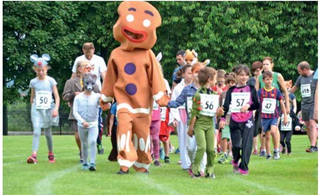
THE fifth annual Lymm Festival Trail Races, organised by Lymm Runners, attracted entries from several other local running clubs as well as individuals.

The day started with local children, many dressed as woodland animals, taking part in a mile-long pursuit of a Gingerbread