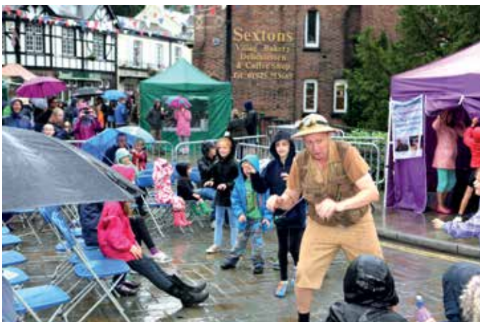
It was a case of on with the show despite the rain.