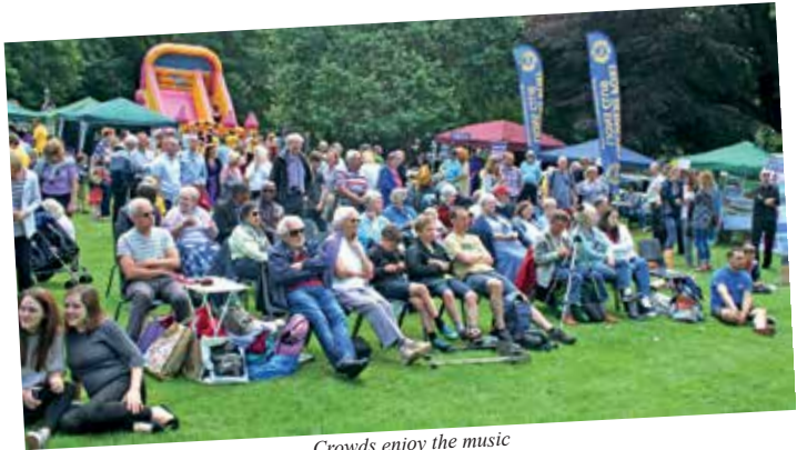
Crowds enjoy the music