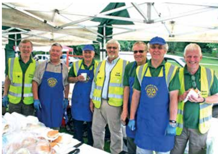
Members of Frodsham & Helsby Rotary Club man the burger stand