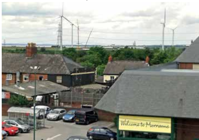
Frodsham Town Council opposed the Frodsham Wind Farm – and look what it got! This picture, showing how the as yet uncomplete wind turbines dominate the Frodsham skyline, was taken from the bridge at Frodsham Railway Station. Frack Free Frodsham and Helsby want to make sure opposition to fracking is more effective.