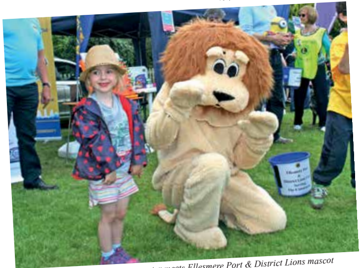
Roaring success - one youngster meets Ellesmere Port & District Lions mascot