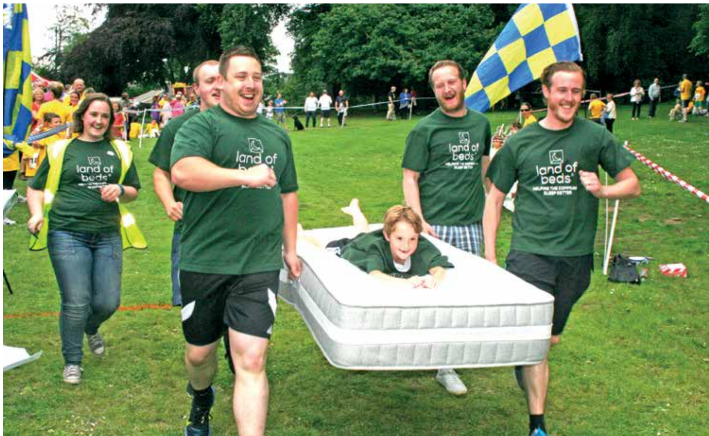
The team from Land of Beds