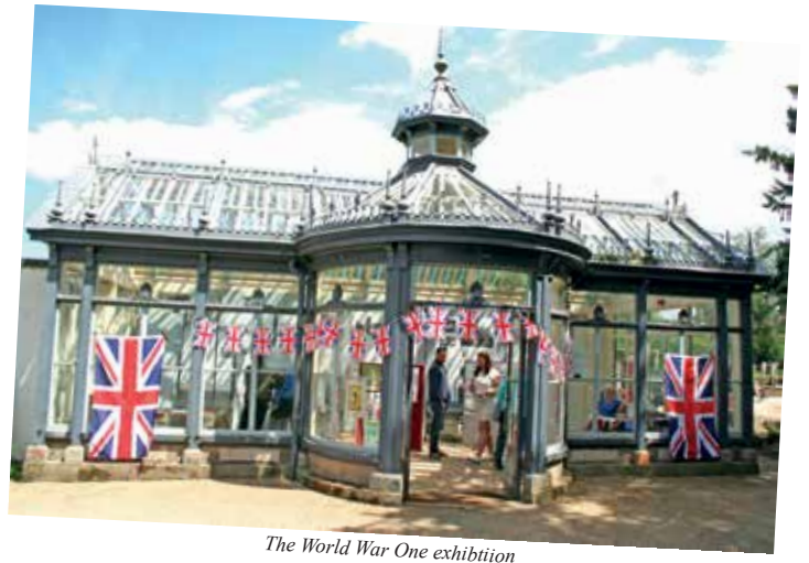
The World War One exhibition