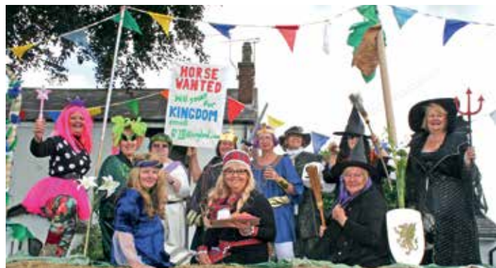
Croft WI float.