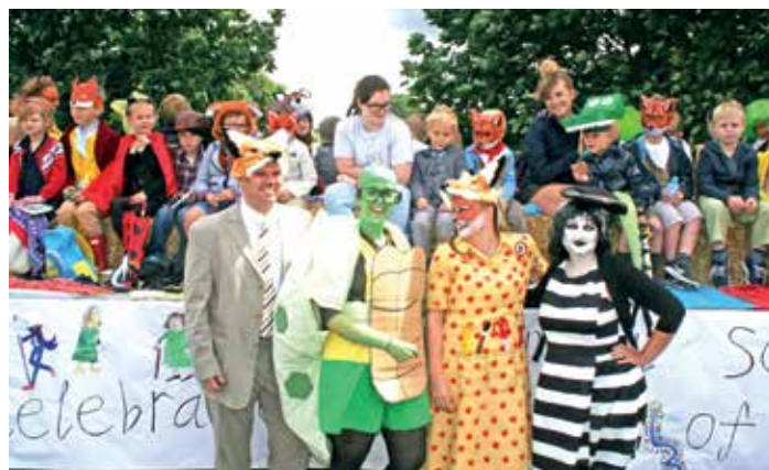
Croft Primary float.