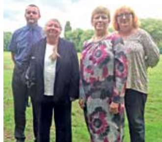
The Labour campaigners.

The borough council says it is committed to carrying out a feasibility programme to deal with the drainage issues.