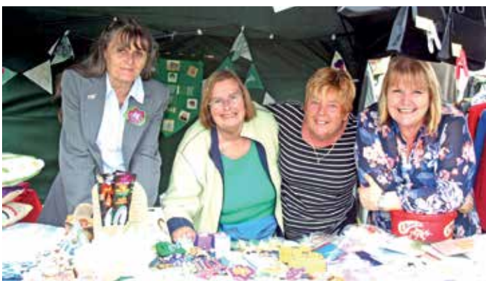
Winwick WI on their stall.