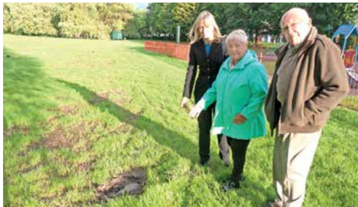
The Tory campaigners.