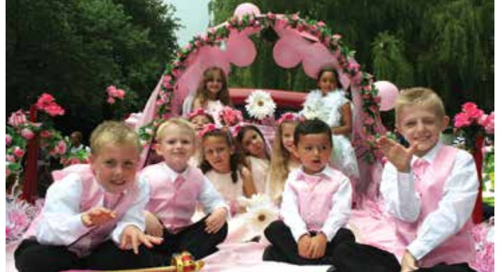
Lymm Rose Queen float.

Queen Parade with Cherry Tree School... He was a rather soggy Man in Black... It didn't dampen the atmosphere- what an amazing community atmosphere!"