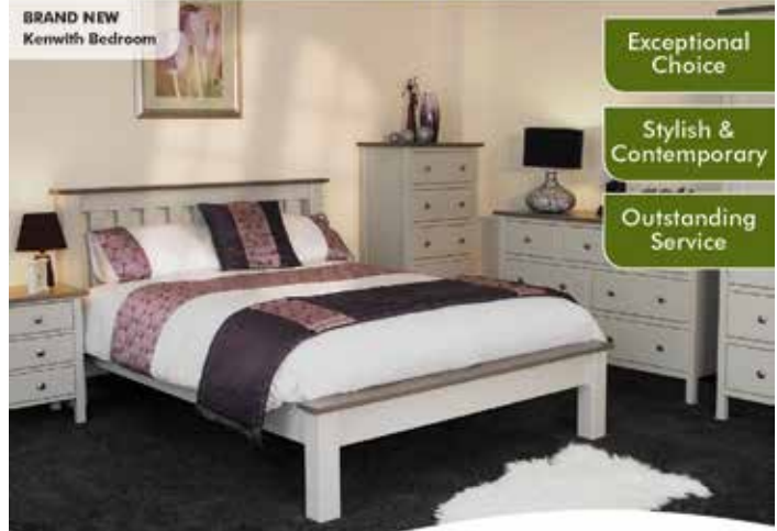
BRAND NEW Kenwith Bedroom