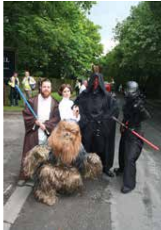
Star Wars cast.