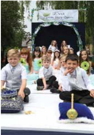
Lymm May Queen float.