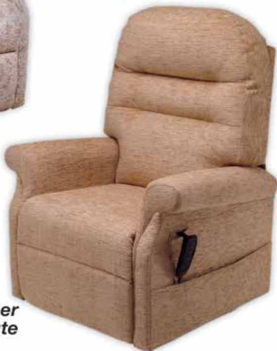
Langdale Riser Recliner in Herringbone Jute

1 Kingsway North, Manchester Road, Warrington WA1 3NL Telephone: 01925 251212 | www.millercare.co.uk