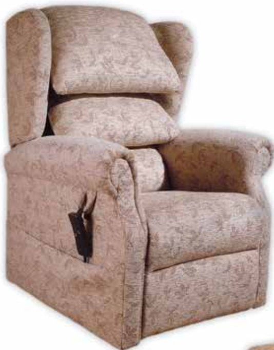
Ennerdale Riser Recliner with Waterfall Cushions in Spray Jute