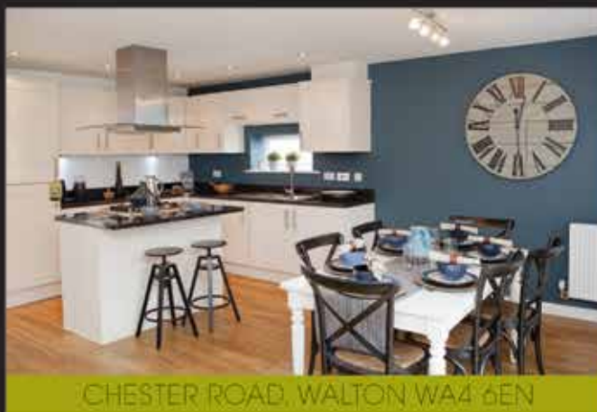
CHESTER ROAD, WALTON WA4 6EN

Register your interest to be one of the first to see these beautiful 3/4 bedroom semi-detached homes. Located in the highly sought after village of Lower Walton, these beautifully crafted homes are perfect for you & your family.