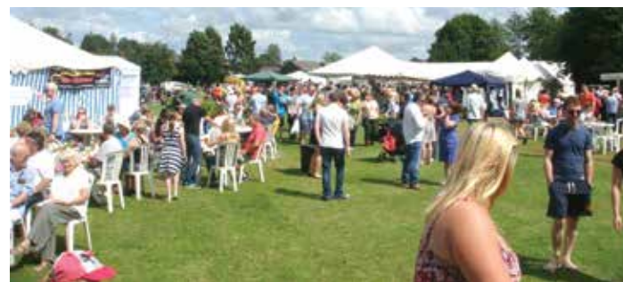
Revellers enjoying the sunshine and entertainment at last year's Festival.