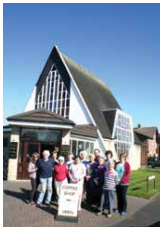
Members of the congregation and the church 50 years ago.

A leaflet about the events is available in the church foyer and further information can be found on the web at www.leighandhindley.org.uk .