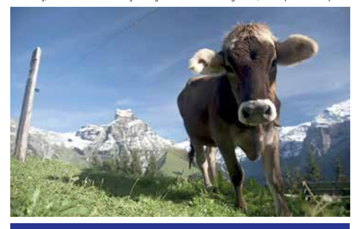
Keep the village alive support your local traders!

enquiries@stocktonheathtravel.com Follow us on twitter @stocktonhthtvl, facebook and linkedin