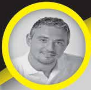
Written by Dave Gibbons Director of Courtyard Homes

Anyone owning a second property that isn't their main residence and buying another, or replacing the one they don't live in, is likely to get caught up in the changes Proposed. The higher rates will only apply to additional properties purchased in England, Wales and Northern Ireland on or after April 1 2016