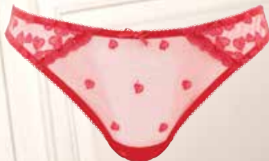
Kali Thong - RRP £12