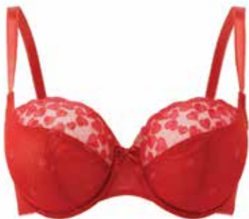
Kali Balconnet Bra - RRP £27

The Panache Kali offers a fun pop of colour to your Spring/Summer '16 lingerie drawer. Kali features pretty embroidery made up of scattered heart shapes, delicate stitch detailing and contrasting centre bow. Available in D-J cup.