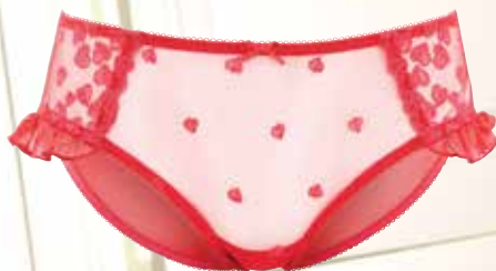
Kali Brief - RRP £14