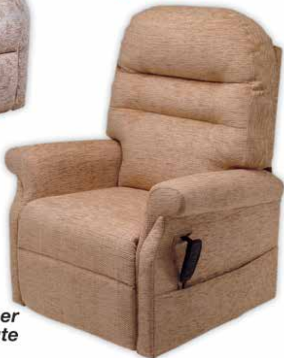
Langdale Riser Recliner in Herringbone Jute