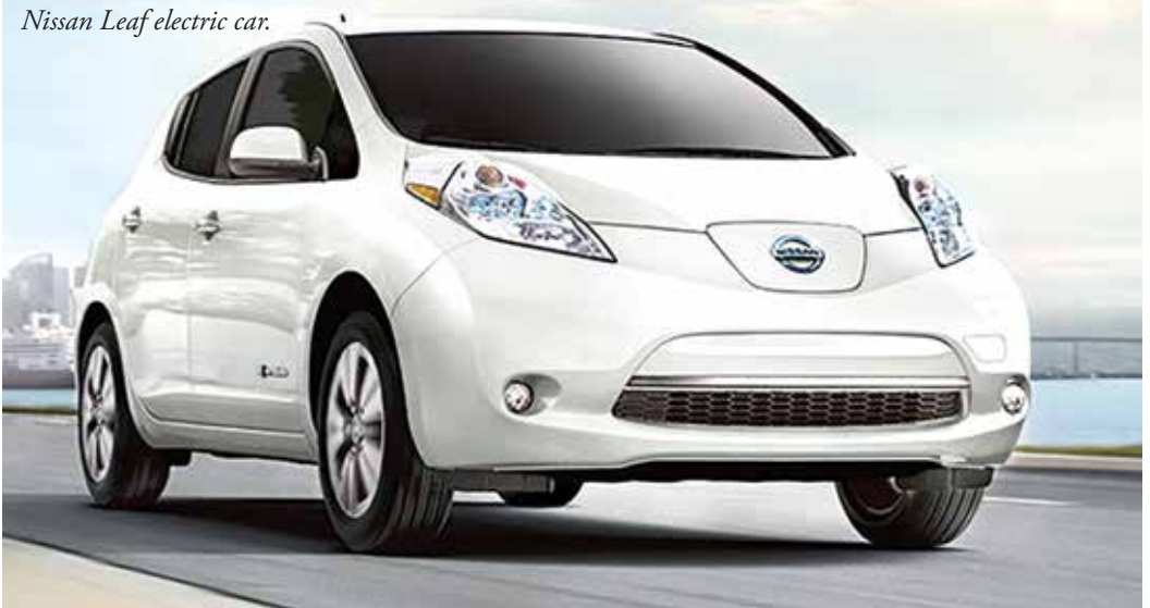
Nissan Leaf electric car.

Some bright sparks will obviously slip-up!