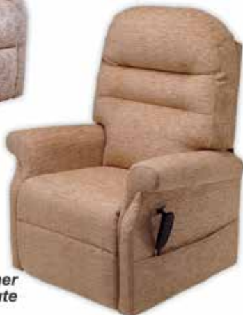
Lilburn Riser Recliner in Herringbone Jute

Recliners Start from £599 with FREE Home Demo includes 3 year warranty