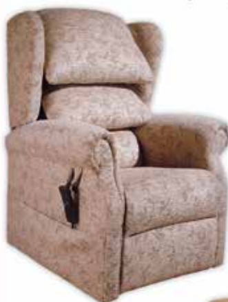
Ellen Riser Recliner with Waterfall Cushions in Spray Jute