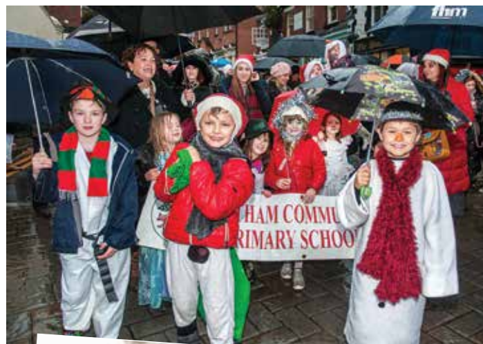
Far left: Santa Dash.