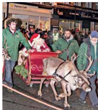
Father Christmas in Frodsham Christmas Festival Parade.