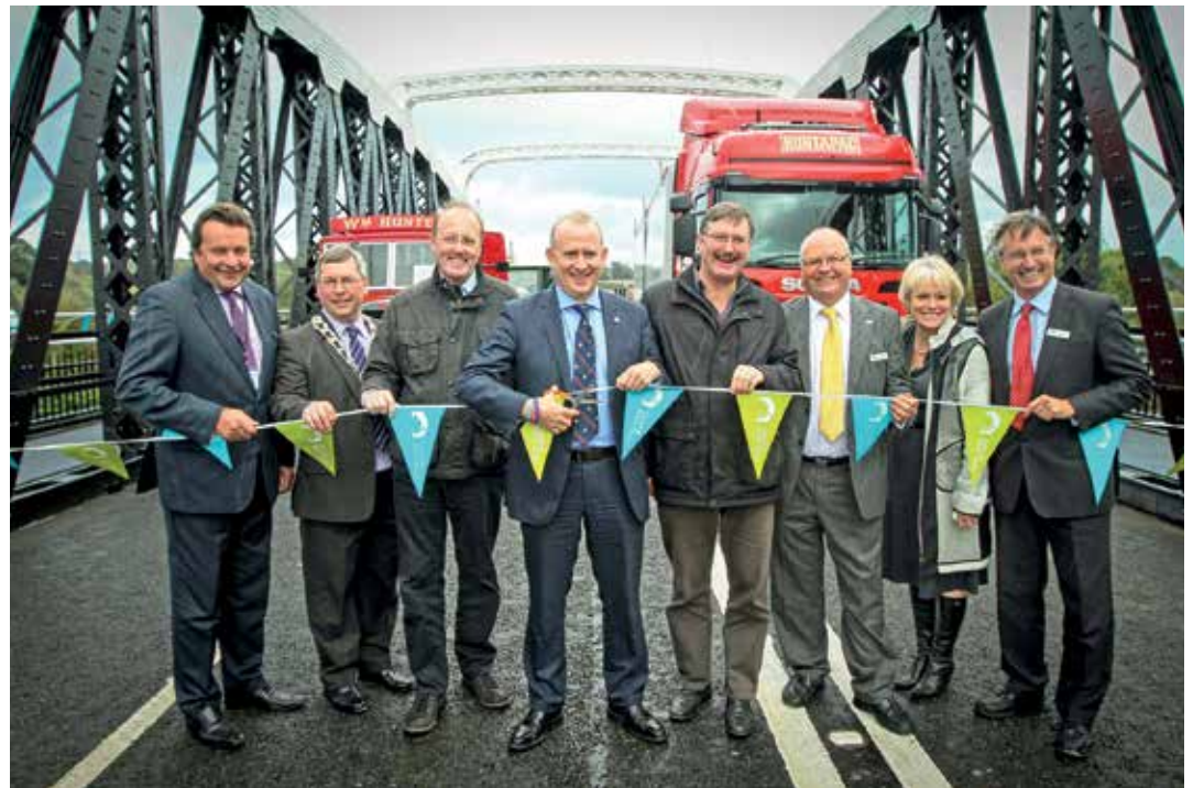
Flashback to the re-opening of the Sutton Weaver bridge.