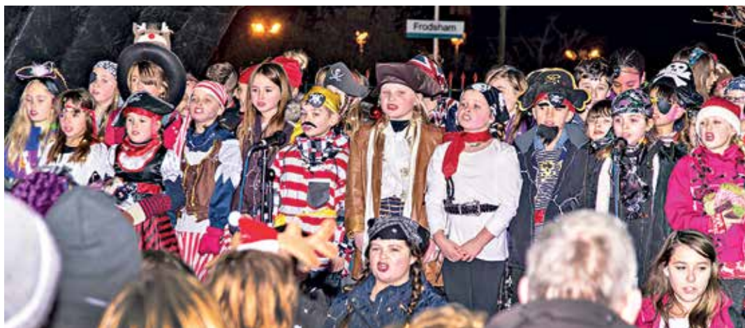
Manor House CP School Choir entertain.