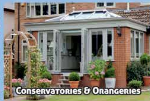
Conservatories & Orangeries

SEE ALL THE PRODUCTS AT OUR SHOWROOM - OPEN 7 DAYS A WEEK