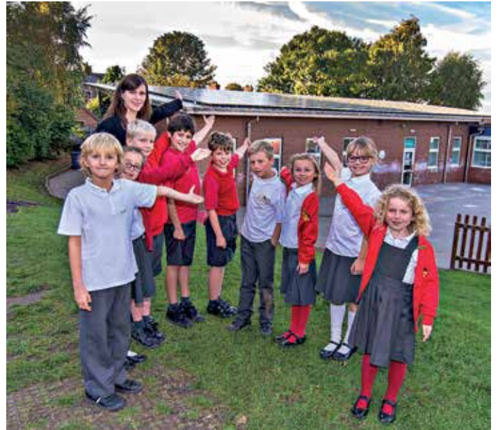
The solar panels at Ravensbank Primary School.

Anyone who would like to help further schemes for other Lymm Schools and community buildings by becoming an investor and making a competitive financial return (a projected pre-tax return averaging 3-4 per cent, plus the a potential one off income tax relief of up to between 30-50 per cent should contact info@lowcarbonlymm.org.uk to express their interest.