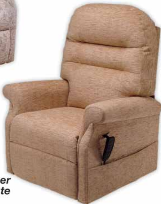
Lilburn Riser Recliner in Herringbone Jute

Recliners Start from £599 with FREE Home Demo includes 3 year warranty