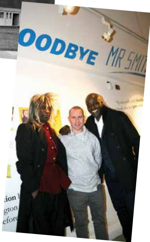
Above: Wiggly, Spike and Fitz at the exhibition