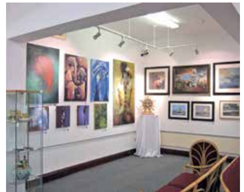
Some of the artwork from the 2014 Eclectic Mix exhibition.

The exhibition runs throughout October, ending on November 5 and admission is free.