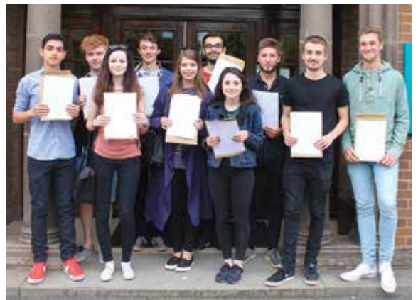
A-Level students celebrate.

Particular congratulations were sent to the 62 students who achieved at least five A* or A grades, and 27 students who achieved eight or more A* or A grades, in their examinations.