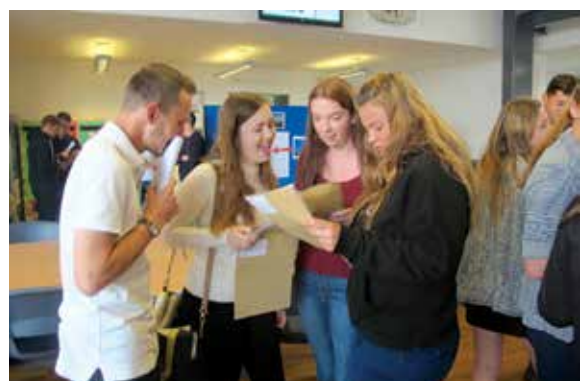
GCSE students celebrate.