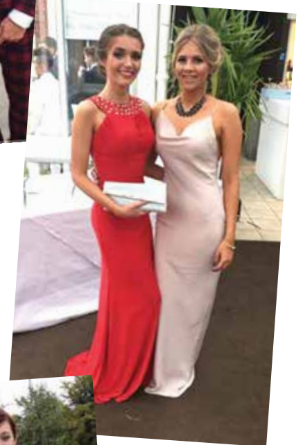
Dressed to impress. Students from Helsby High on the way to Prom Night.