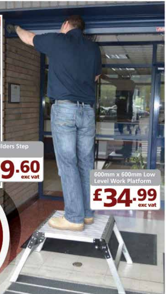
600mm x 600mm Low Level Work Platform