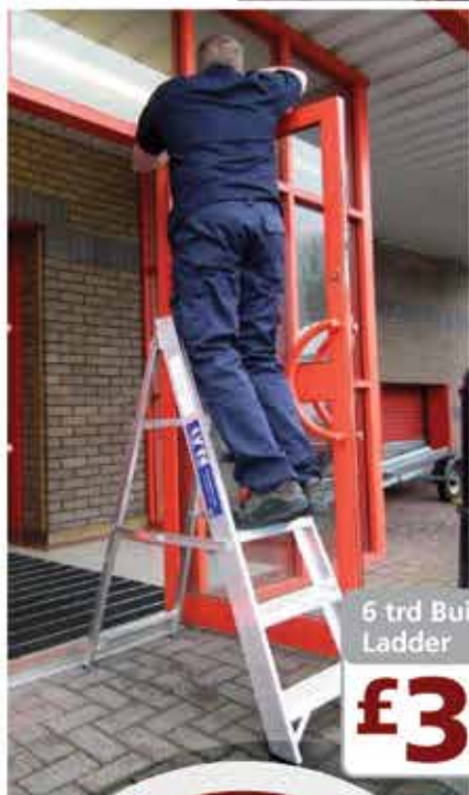
6 trd Builders Step Ladder