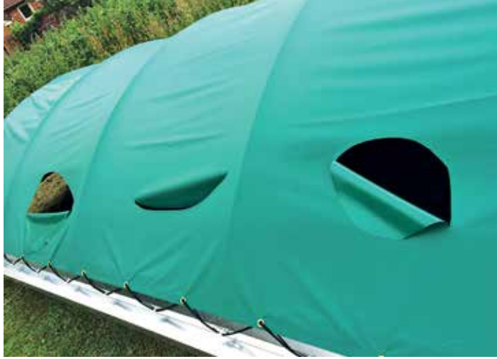
A close up of three gaping holes in one of them and below, the three wicket covers just after they were delivered.

Club chairman Sean Caine left the covers safe and secure at 10.40pm but they were found