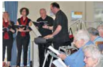
Residents sing along with members of the Culcheth Choir.

"I would like to personally thank all the dedicated staff at Padgate House and all our care homes across the town for their continuous hard work."