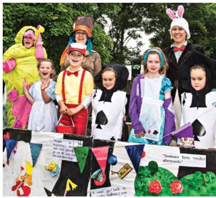
Rainbows, Alice in Wonderland,

Theme for the floats which took part in the festival procession were "book