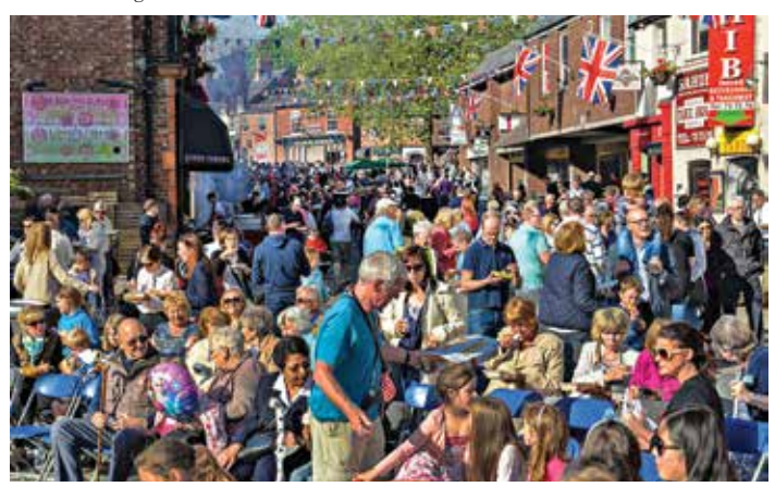
Crowds flock to the food festival.