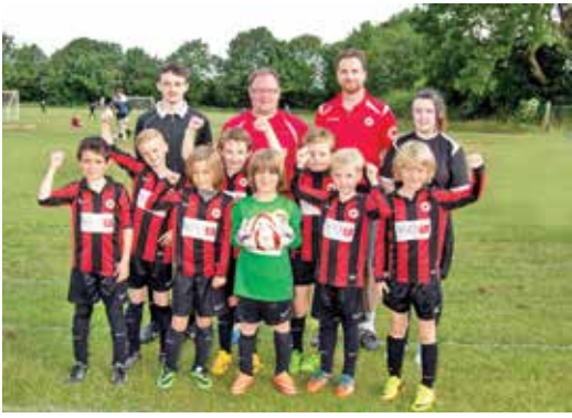
Celebrating the event are Frodsham Town One under 8s and Frodsham Park under 7s with organisers and referees.