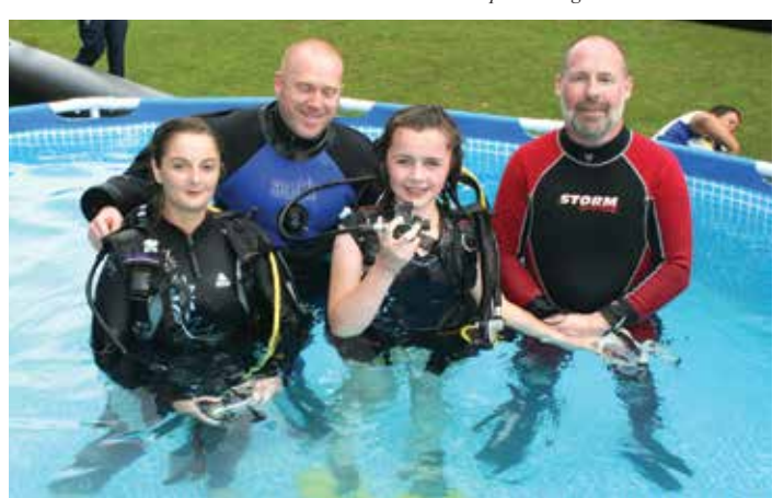
Scuba diving will be available on site.