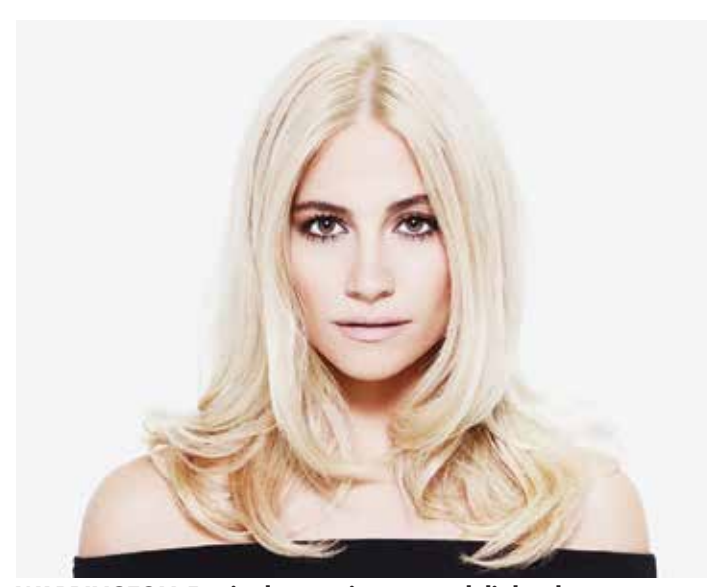
WARRINGTON Festival organisers are delighted to announce four-time BRIT Award nominee Pixie Lott as the headline artist for the main event in September.

Pixie will play a live show on Saturday, September 19 at Bank Park Warrington, as part of a series of events. Tickets are on sale now.