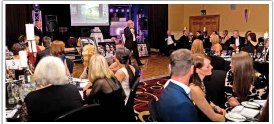
Thank you to Andrew Collier Photography for providing the photographs from the evening.

I would also like to thank everyone who donated raffle and auction prizes which raised £6000 on the night.