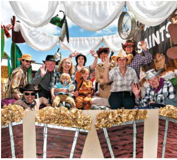
A float from last year's event.