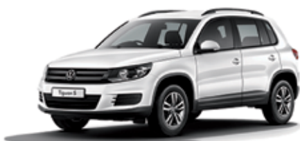
Volkswagen Tiguan Diesel Estate 2.0 TDI BlueMotion Tech Match £184.14 + VAT per month 6+23 BCH 10k miles a year