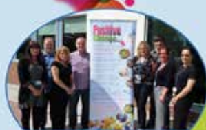
GGHT's Employment Initiatives Team