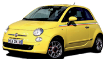
Fiat 500 Hatchback 1.2 Sport £109.99 + VAT per month 3+35 PCH 10k miles a year