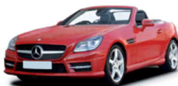
Mercedes-Benz SLK 250 CDI AMG SPORT £199 + VAT per month 9+23 BCH 10k miles a year