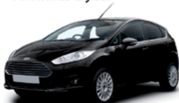
Ford Fiesta 1.5TDCi Zetec 5dr (2013) NO DEPOSIT £150.71 per month PCP 10k miles a year