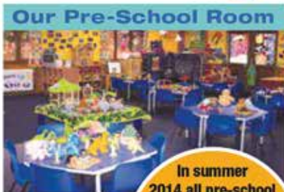
Our Pre-School Room