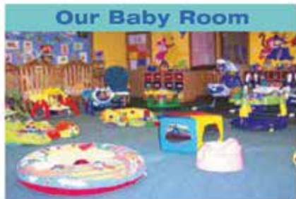
Our Baby Room