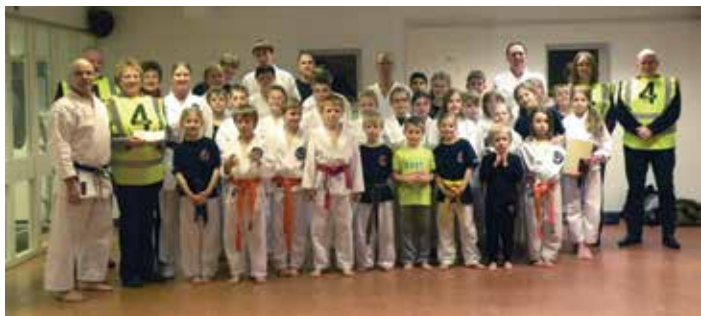
Gendai Members along with representative of 4Lymm.